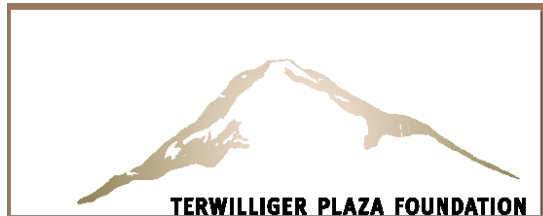
Donor Wall (2014) Masthead

In the recommendation, the committee proposed establishing the Foundation, "To develop appealing programs to encourage TP members and others, to support the TP Foundation through gifts and bequests. The programs should promote various methods of giving, restricted and unrestricted (inclusive of beneficial tax advantages